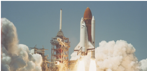
First launch of the space shuttle Challenger, 1983.