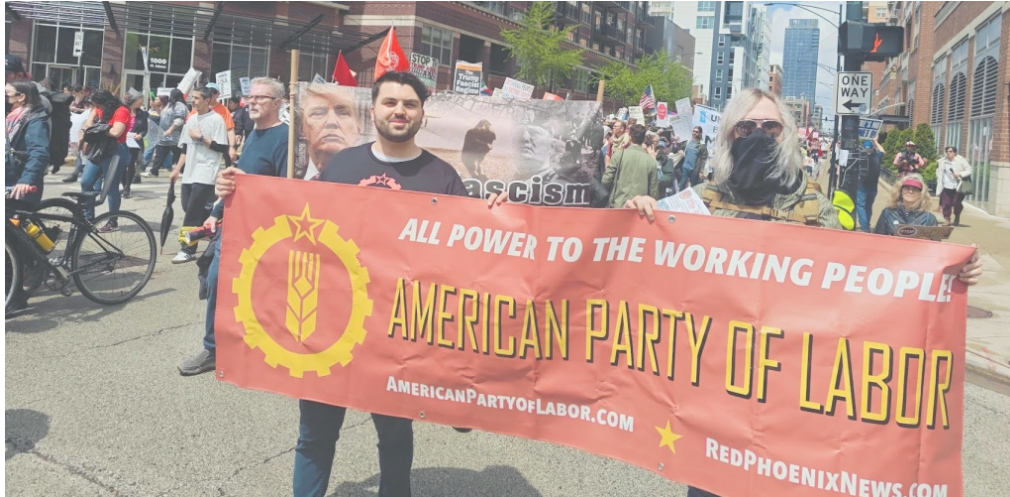
Chicago, IL.

This May Day, the Labor Commission of the American Party of Labor surveyed its members about two questions: “What does May Day mean to you?” and “Why are you a Communist?”