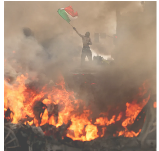
A man waves a Mexican flag as smoke and flames rise from a burning vehicle during a protest against federal immigration sweeps, near Los Angeles City Hall, in downtown Los Angeles, California on June 8, 2025.