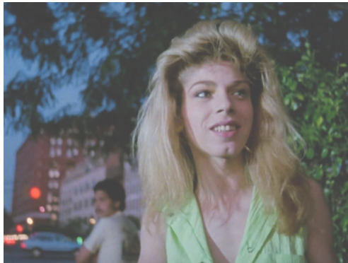
Venus Xtravaganza in a still from "Paris Is Burning."