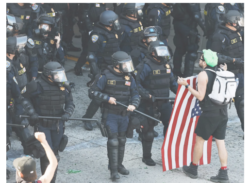
California Highway Patrol (CHP) officers clear protestors who were blocking the 101 freeway in Los Angeles on June 8, 2025.