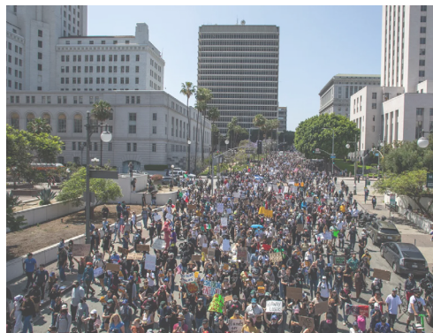
Protestors against immigration raids march from Los Angeles City Hall to the LA Federal Building on June 8, 2025.