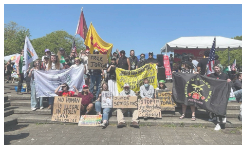
Salem, OR.

"I'm a communist because I grew up seeing how capitalism devalues human life—especially the lives of the poor, the disabled, the marginalized. I became a mother in a