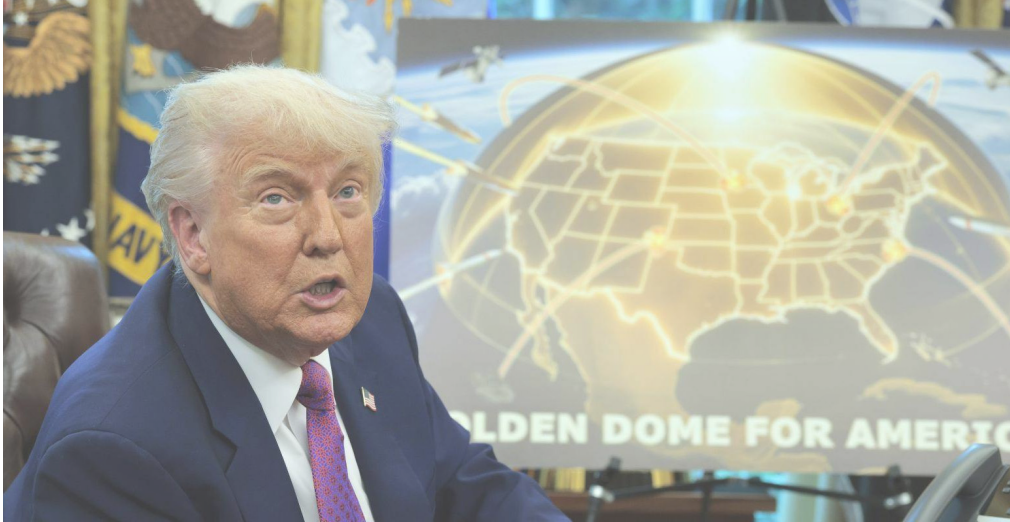
President Trump announces the 'Golden Dome for America' project in the Oval Office at the White House in Washington D.C., May 20, 2025.