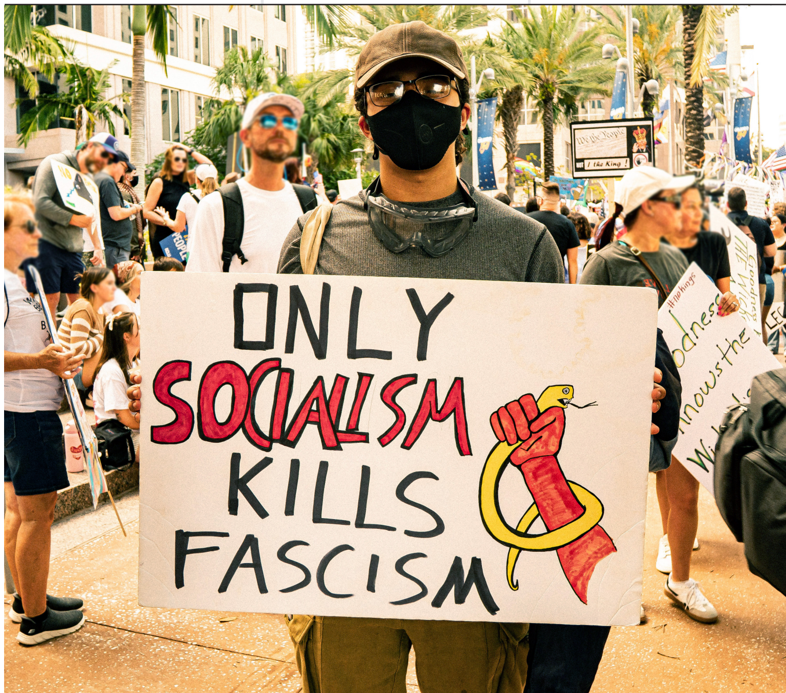
Orlando, Florida: Demonstrators protested against the Trump administration as part of the nationwide "No Kings" movement on June 14, 2025.