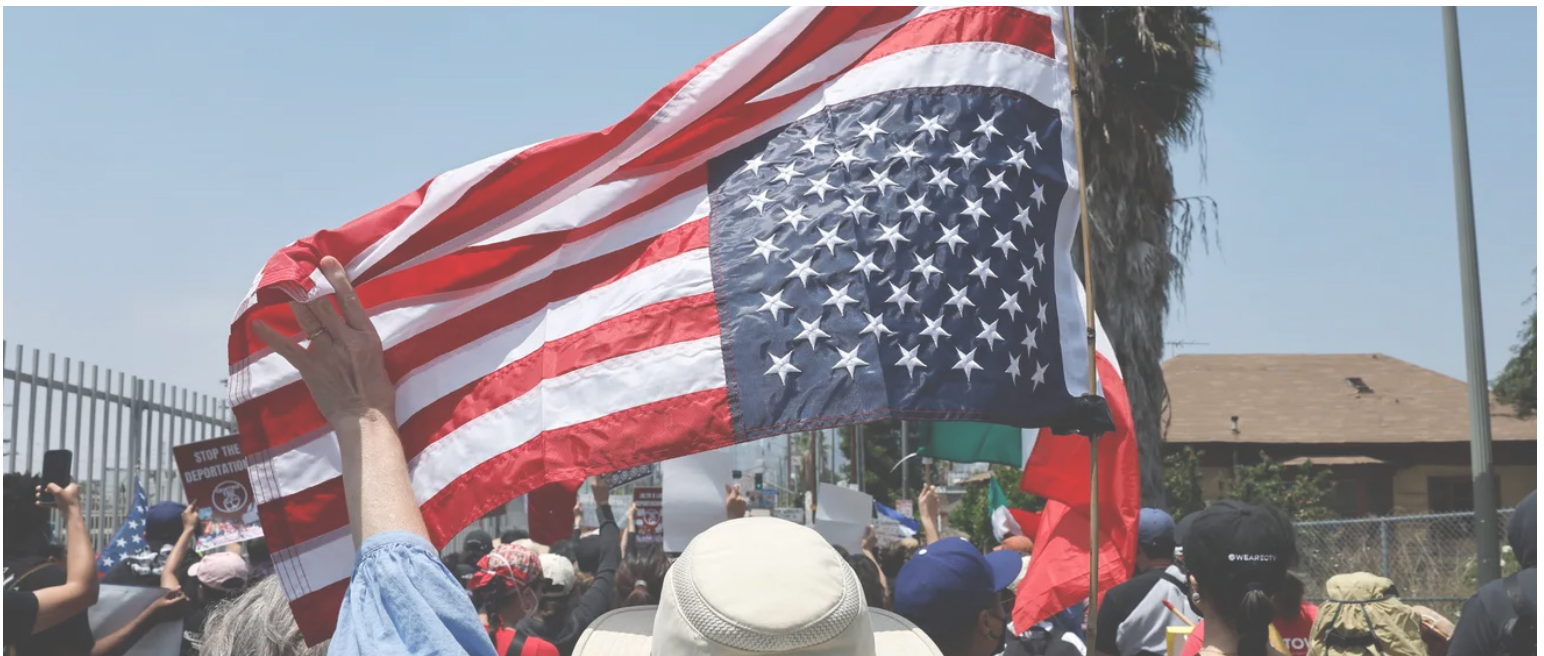
A protestor carries an upside-down American flag as demonstrators against immigration raids march toward downtown Los Angeles on June 8, 2025.