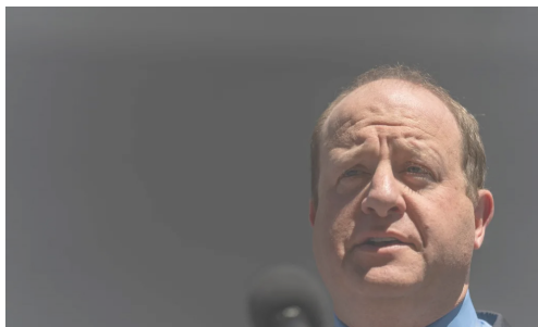
Gov. Jared Polis speaks to reporters during a news conference in Denver.