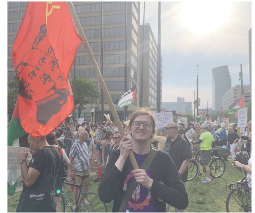
Baltimore, MD.

“May Day makes me remember the sacrifice of coal miners in Eastern Kentucky. It makes me think of the hard working people, the union victory and defeats, the hope and yet suffering of the fighting laboring class. This is what makes me a communist, to see with my own eyes the struggle of some of the hardest working Americans while being exploited just like they were in history in Harlan Bloody Harlan. I want to be a communist not just to fight for these workers in Appalachia but for all my siblings of the world proletariat.”