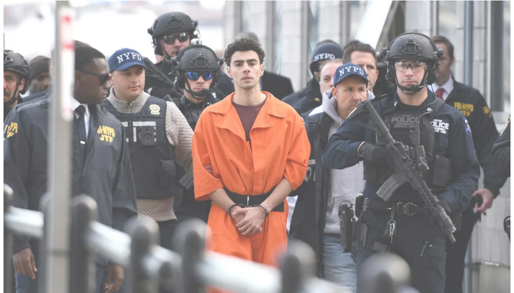
Luigi Mangione, the man accused of killing United Healthcare CEO, was escorted by police from a helicopter to a van on Dec. 19, 2024, in New York.

As far as Marxism-Leninism is concerned, individualized terrorism is the movement's punishment for opportunism and disengagement. Too many organizations demagogically pander to the concerns of the