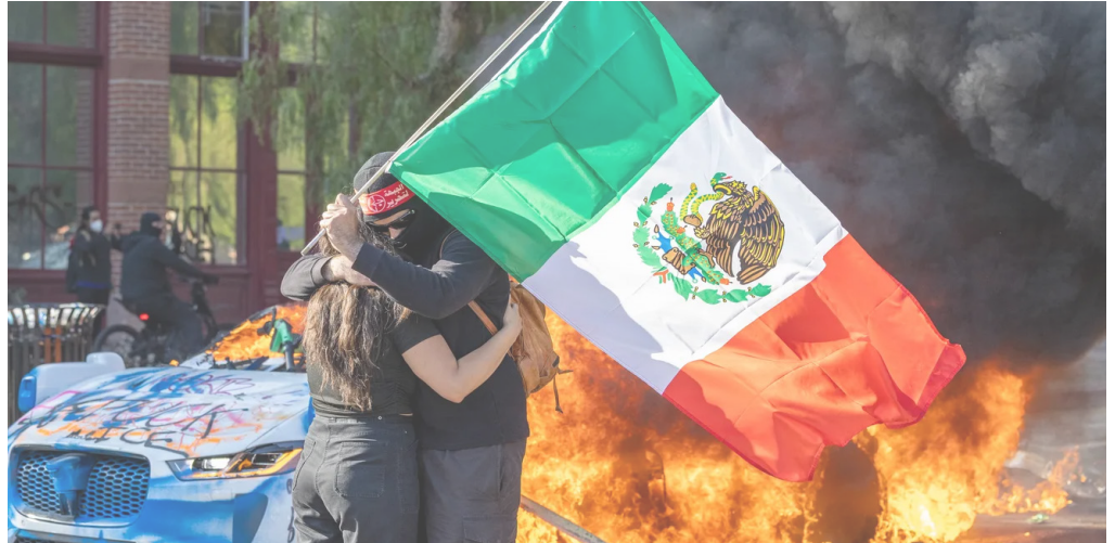
A couple with a Mexican flag embraces as a Waymo vehicle burns, as protesters clash with law enforcement in the streets surrounding the federal building during a protest in Los Angeles, June 8, 2025.

Oh, it's easy to play at being a communist. It's easy to pose for selfies wearing ridiculous-looking, and unearned Soviet militaria. It's easy to post "dank memes" with all sorts of slogans on them. And it's always been way too easy to posture about how r-r-revolutionary one is while denouncing everyone else. But to be a true communist and stand up when everything seems to be going against us; to be a true comrade to our sisters and brothers who are feeling the blows of fascism on their bodies or in their hearts; to be a genuine servant of the people, as opposed to proclaiming oneself as such,