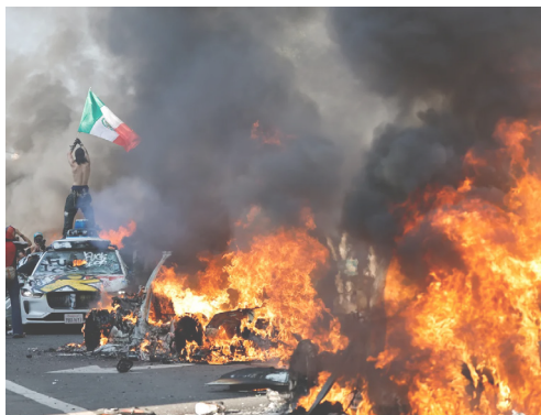
A protestor holds up a Mexican flag as burning cars line the street on June 8, 2025 in Los Angeles.