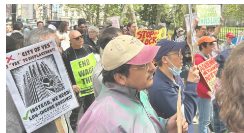
New York City, NY.

"May Day is, to me, a beautiful example of internationalism and solidarity among the working class. For over one hundred years the workers of the world have come together annually to celebrate the struggle for their liberation. Seeing that unity every May gives me hope and a warm fraternal feeling I've never felt anywhere else."