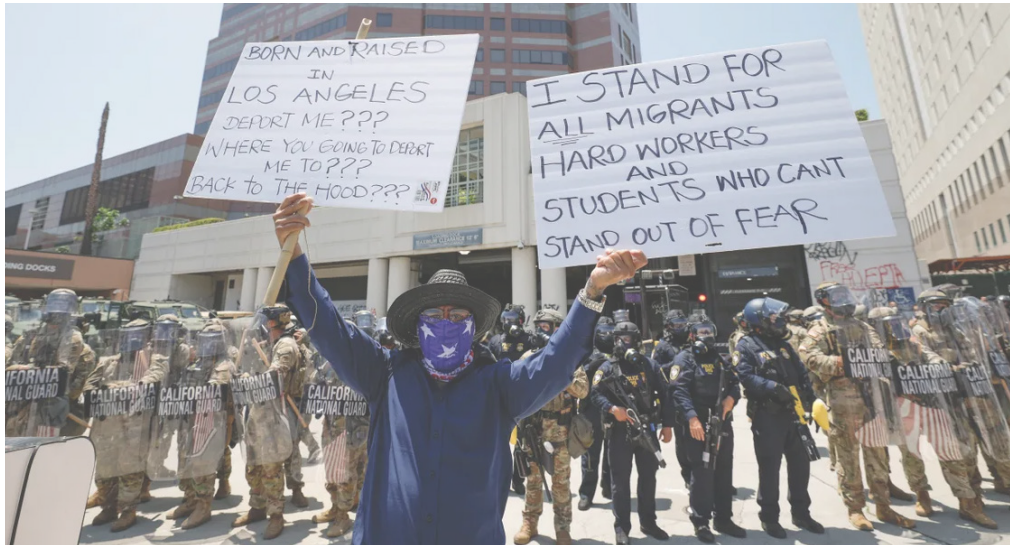
A demonstrator holds up signs during a protest against federal immigration sweeps outside the Edward R. Roybal federal building in Los Angeles, California on June 8, 2025.