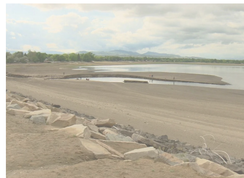
Before and after photos of Lake Loveland, in 2020 (left) and 2025 (right).