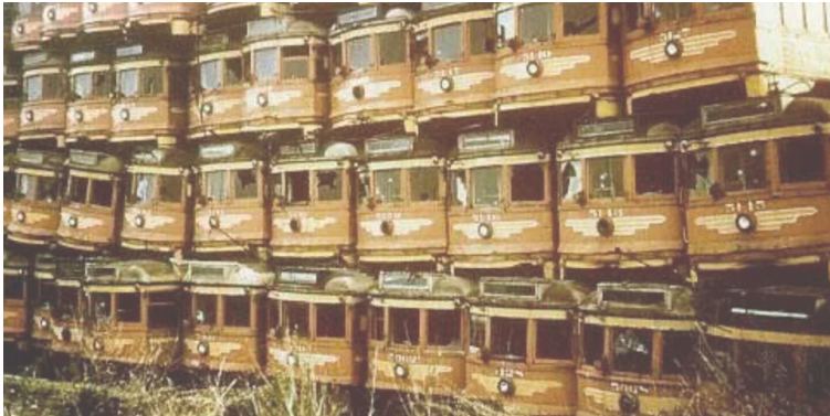
Retired Los Angeles streetcars, ca. 1950s. The once-robust LA railroad system was replaced with buses after a major privatization effort by General Motors in 1949.

These delays keep thousands of workers stranded in the city, where they either have to wait for an unknown amount of time, usually hours, until the problem is fixed, or pay exorbitant fees for a taxi just to get home. One commuter reported to the Red Phoenix that they end their workday at 5:30 PM and arrive home at nearly 9:00. After long and difficult working days, workers face yet more degradation navigating the crumbling public transit system.