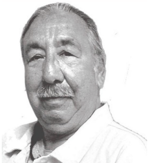
From the Secretariat of the American Party of Labor | Jan. 27, 2025

On the last full day of his presidency, Joe Biden granted partial amnesty for Leonard Peltier, a political prisoner who has so far served 46 years of his unjust two consecutive life sentences. It is imperative to stress that Peltier is not granted full clemency, he is simply remanded to house arrest for the remainder of his life. A rare breach in the merciless, ironclad face of the bourgeois legal apparatus, but ultimately characteristic of the Biden presidency: The art of the delayed half-measure. It is a consolation to the oppressed, before the shambling state