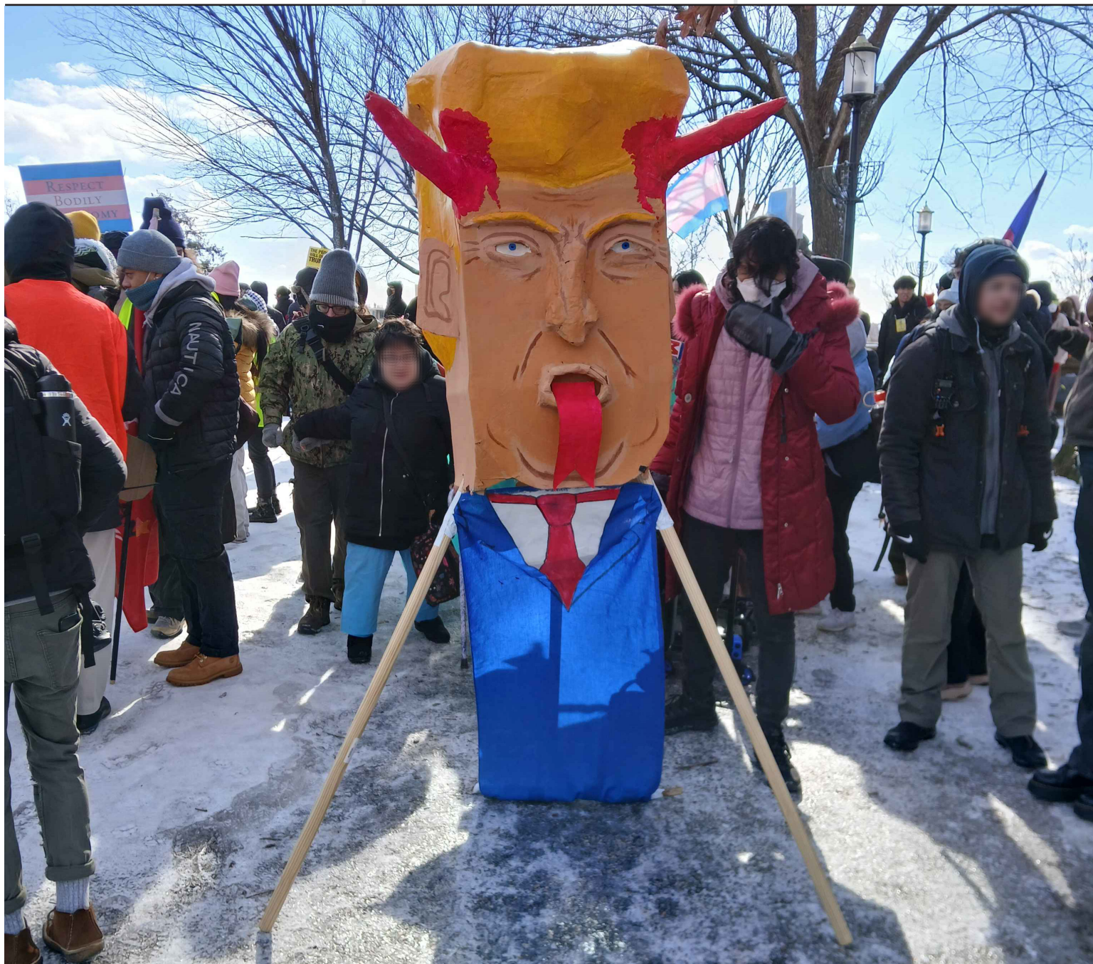
Demonstrators protest against the inauguration of Donald Trump in Washington, D.C., Jan. 20, 2025.

By the Secretariat of the American Party of Labor | P. 7