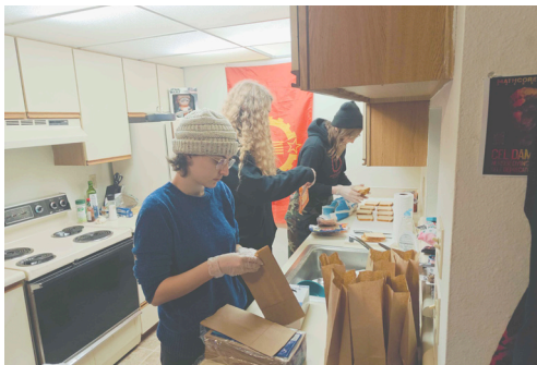
APL Pacific Northwest (John Reed Division) | Washington | Jan. 9, 2025

The evening of Dec. 28, members of the John Reed Division of the American Party of Labor ran one of our Service to the People programs in downtown Seattle, distributing free sandwiches, toiletries, drinks, and snacks to people of the local homeless community, including Halal and Kosher options.