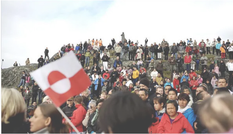
Some of Greenland's 58,000 people in Nuuk at a 2009 ceremony giving the country powers of self-governance.

Joint statement of the Workers' Communist Party (APK), Denmark, and the American Party of Labor (APL), USA | Jan. 31, 2025