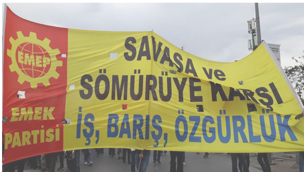
An Emek Partisi (Labor Party) banner reads, "Against war and exploitation. Work, peace, freedom."