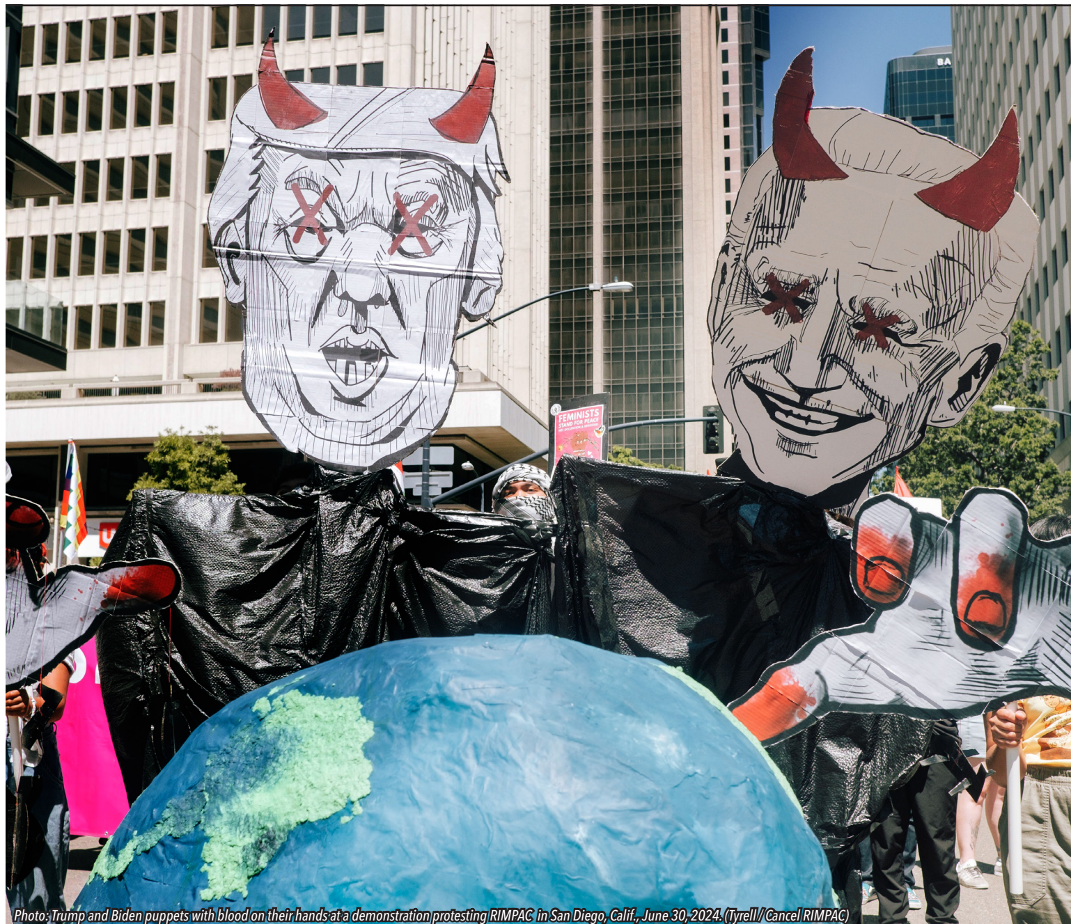
Photo: Trump and Biden puppets with blood on their hands at a demonstration protesting RIMPAC in San Diego, Calif., June 30, 2024.

AmericanPartyofLabor.com — RedPhoenixNews.com — Issue #33 — July 2024 — Donations accepted — Please copy and redistribute!