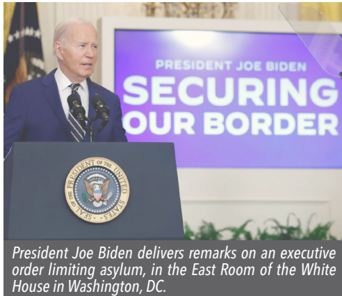
President Joe Biden delivers remarks on an executive order limiting asylum, in the East Room of the White House in Washington, DC.