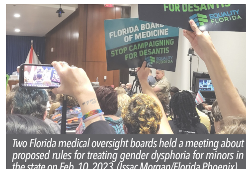
Two Florida medical oversight boards held a meeting about proposed rules for treating gender dysphoria for minors in the state on Feb. 10, 2023.

This Pride month, and every month, stand up to the fear mongers and sellers of moral panic. Protect trans lives, smash the capitalists, and reject this broken system that has brought the workers to this point of desperation. Socialism is the future!