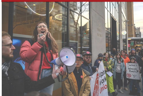
Members of the Alphabet Workers Union (CWA) hold a rally outside a Google office in response to layoffs in New York Feb. 2, 2023.