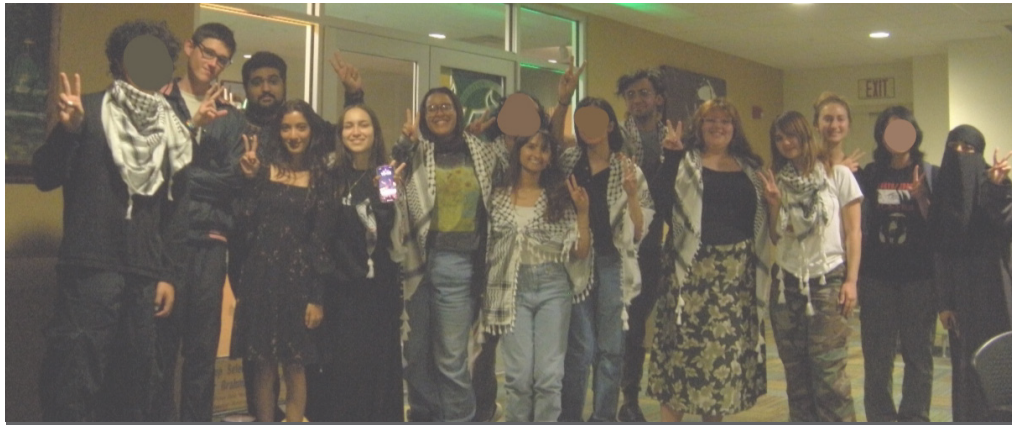
USF students celebrate after the passing of the resolution on April 10, Tampa, FL.