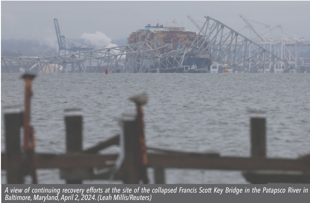
A view of continuing recovery efforts at the site of the collapsed Francis Scott Key Bridge in the Patapsco River in Baltimore, Maryland, April 2, 2024.