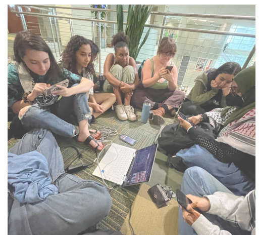
Students watching the Student Government meeting on a livestream.