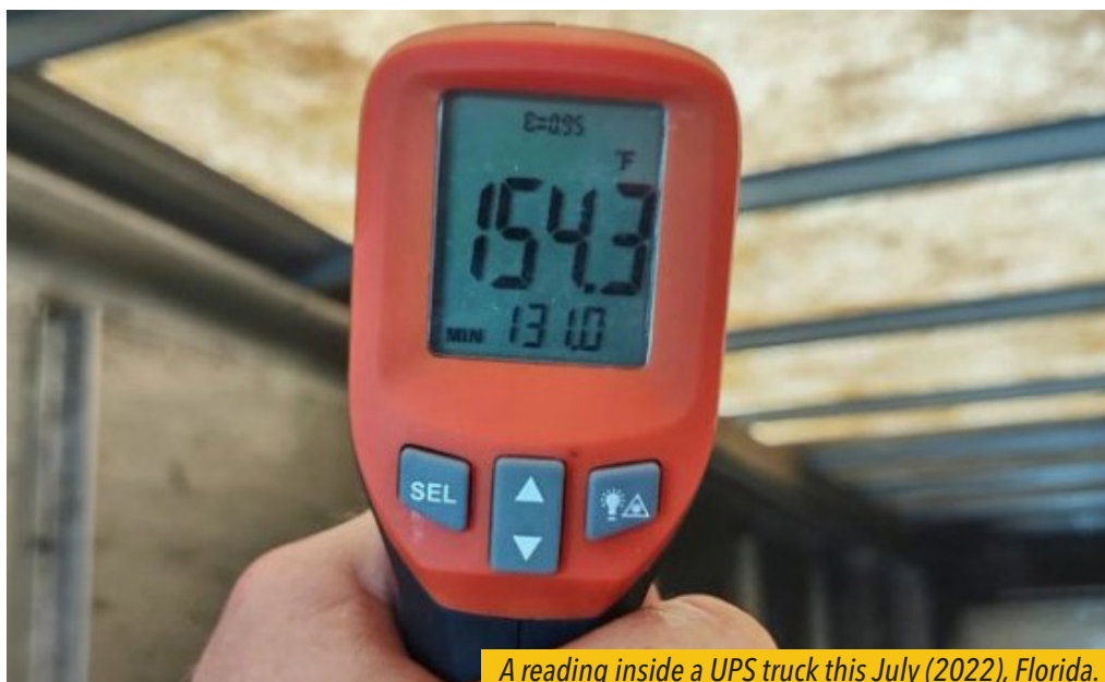
A reading inside a UPS truck this July (2022), Florida.

The delivery drivers and warehouse workers are aware of this very danger, as over the course of these past Summer months, UPS employees all across the country were succumbing to extreme cases of heat exhaustion and at times fatal instances of heat stroke. Delivery drivers across the nation were reporting temperatures as high as 116 to 120 degrees in their trucks. Drivers typically have anywhere from 150 to 200 stops a day, with as many as 300 packages to deliver during shifts that last up to 14 hours. Yet, the trucks they drive lack air conditioning due to the company's claim that it would be "ineffective," but one could easily argue that allowing the trucks to reach temperature