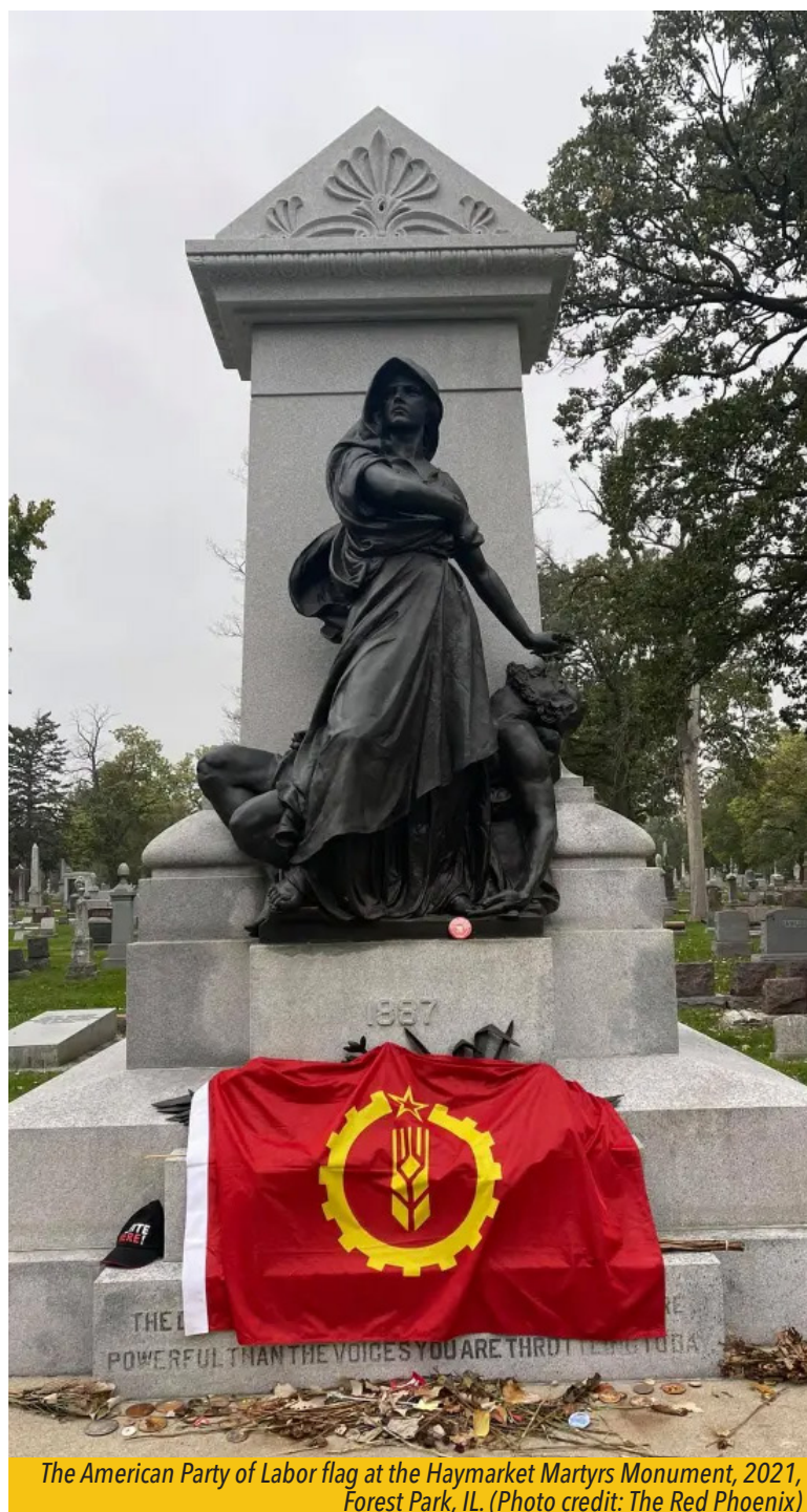
The American Party of Labor flag at the Haymarket Martyrs Monument, 2021, Forest Park, IL.

Resurgent unionism has nonetheless risen in these conditions. Countless strikes organized at the workplace from fast food fights for 15, to graduate student unions, to rideshare strikes emerged in 2019, which led to the huge growth in union efforts at some of the largest companies in the US, including Starbucks and Amazon. These movements have come to define the growing leftist movement in the United States, despite corporate attacks and sabotage. The DSA Convention, largely panned for its procedural "difficulties" and reformist perspectives, nonetheless clearly declared democratic unionism to be the beating heart of the American left. This growing movement demands greater organization than what currently exists, and workers have risen, often autonomously, and against the reformist democratic party and moderate union leadership, to that challenge. Bringing the militancy of our May Day marches to this day in this context, reflects the general turn in American left strategy to bring our politics to the American worker, to merge our spaces, and make left spaces less exclusive and distinct from the lives of American workers.