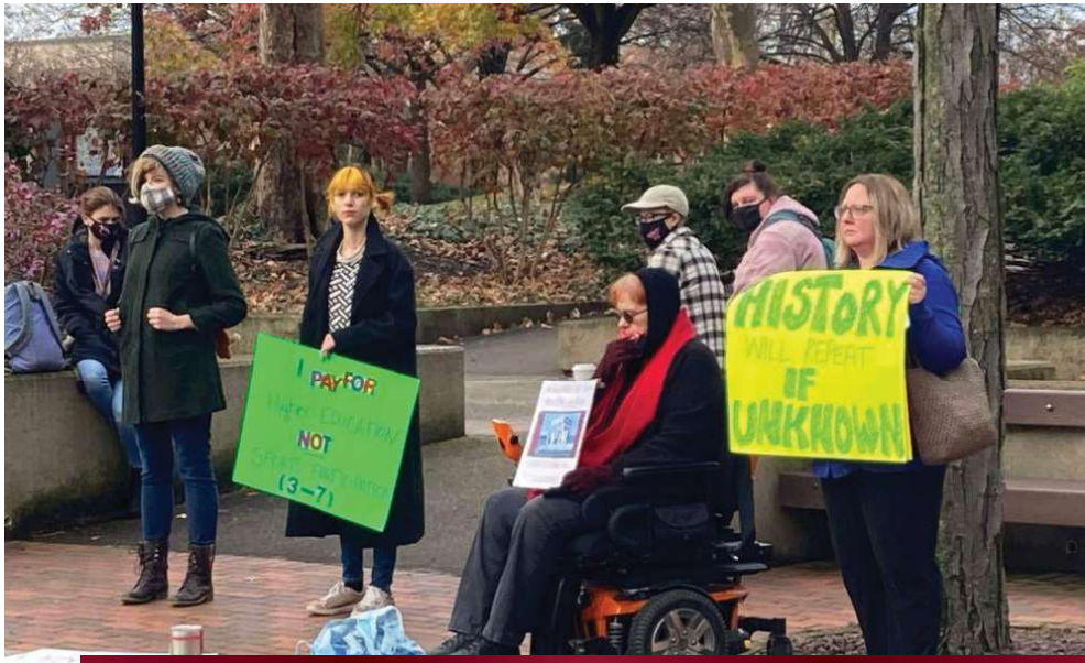
Students and staff protest at Youngstown State, December 1st, 2021.

By: Bobby Gallagher, Red Phoenix Correspondent Ohio, February 2nd, 2022