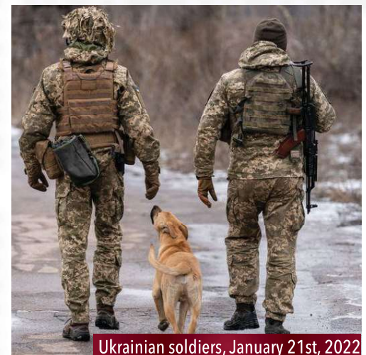
Ukrainian soldiers, January 21st, 2022

Since the Russian intervention in the Syrian civil war in September 2015, it has become clear that although the US retains its primary and dominant imperialist position in the imperialist-capitalist world order, it is not as effective as it was in the past.