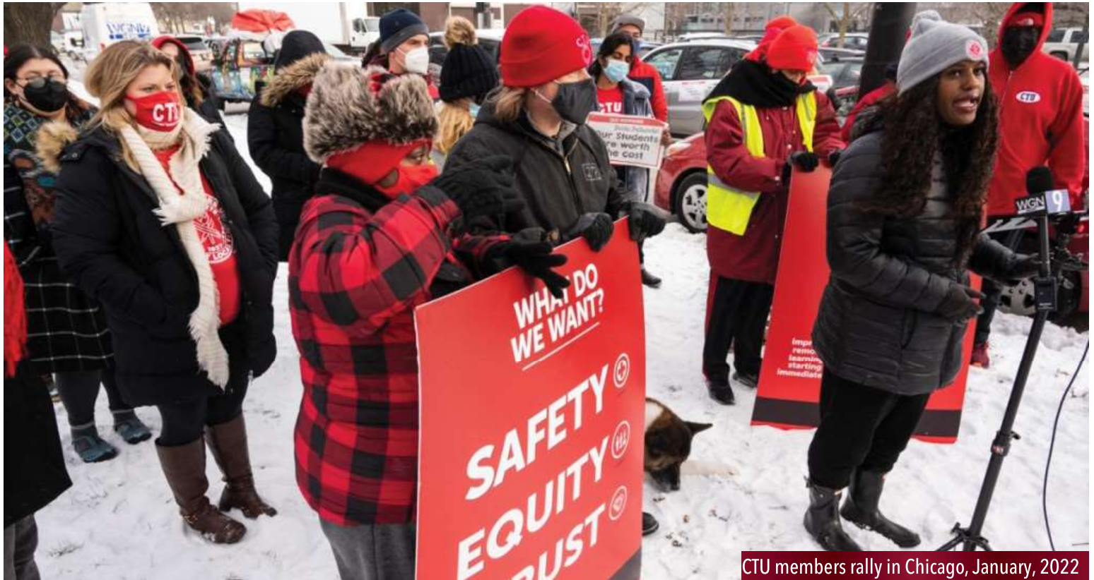
CTU members rally in Chicago, January, 2022