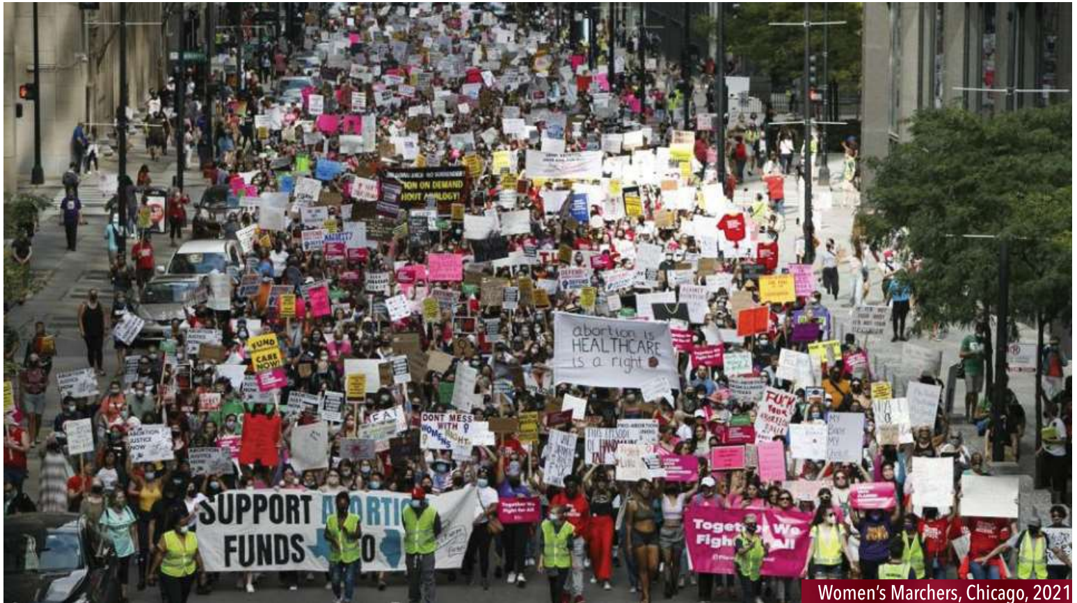
Women's Marchers, Chicago, 2021