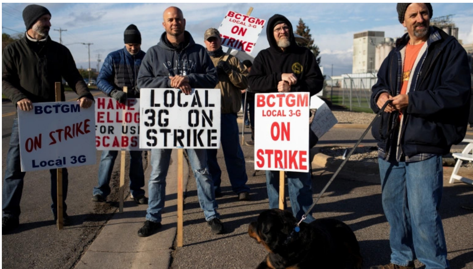
Workers at a Kellogg's plant in Battle Creek, Michigan. The Kellogg's strike was one of many notable strikes in October which inspired the term "Striketober."