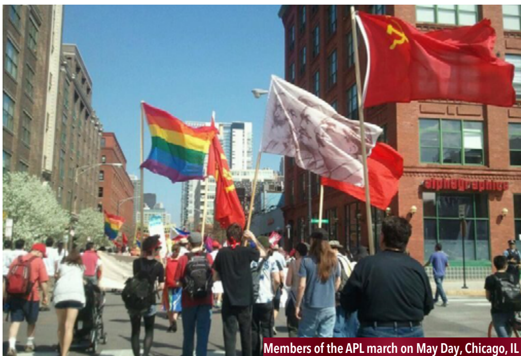
Members of the APL march on May Day, Chicago, IL

In prior stages of human development, with a more or less undeveloped understanding of science, these societies tended to assert moral idealism dependent on the establishment of social concepts such as gender identity and roles stemming from a rudimentary grasp on sex. Upholding these assertions reinforces the dominant class ideology of a given time. In slave society, the patriarchy emerged alongside private property rights and the enslavement of individuals as a means of social control, alongside the submission of women to control the inheritance of the established property