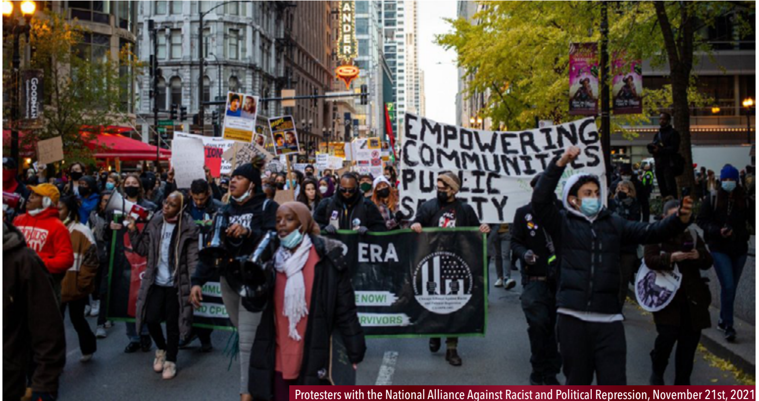
Protesters with the National Alliance Against Racist and Political Repression, November 21st, 2021