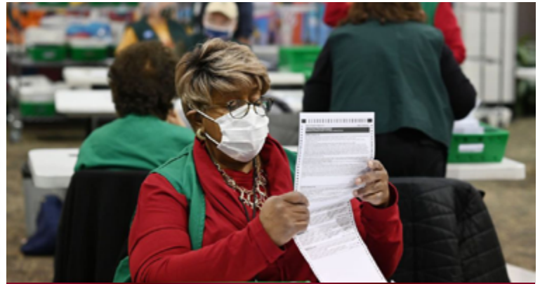
An election worker counts ballots in Denver, Colorado

In Seattle, moderate Bruce Harrell defeated progressive Lorena Gonzalez with 59.29% of the vote to her 40.41%. These results were particularly relished by corporate pundits given the intensity of the clashes between protestors and the police in the city, as well as Gonzalez's support for community control of the police and for defunding the SPD. A closer analysis of the election betrays an uncomfortable truth for those same reactionary and liberal pundits-of the 490,000 eligible voters in Seattle, just under 250,000 turned out to vote in this city-wide election. That is a turnout of only 51.01%. Similarly in the NYC mayoral race local moderate Democrat and former policeman Eric Adams made history in making himself the second black man to become the mayor of NYC. In New York City, where there are 4.9 million registered voters, no more than 1.2 million New Yorkers cast their vote in the Tuesday election, and of the 969,608 ballots cast in the mayoral election alone, a little more than 30% voted against the Democrat ticket. The overall turnout for all the offices up for grabs amounts to just 24%, this annoying little detail does not frustrate the Wall St. Journal from declaring that, although Mayor Adams will have a hard battle against progressives in his own party (clearly a decisive and clear victory for moderation), that he has a "clear mandate to do so." What a mandate to have less than a quarter of the city behind you!