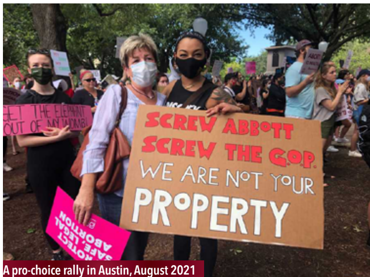
A pro-choice rally in Austin, August 2021

By: Ian Cox, Red Phoenix Correspondent Texas Sep 6, 2021