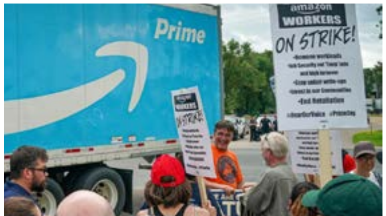
Amazon workers in Bessemer, Alabama, November 2020

Workers in a poverty stricken area of an increasingly anti-union state, who are unionizing against a company owned by the richest and most notorious anti-union man in America, are a shining light to the working people that the power is truly in the hands of the people and not the corporations. It is important to remember the working class communists of all races, classes, and genders in the Great Depression South who ignited the first attempts in organizing the labor of sharecroppers, the unemployed, mine workers, and other workers in Alabama. The focus of these communists was not only on racial unity, but they also focused on social justice, which was largely unheard of in the Great Depression South. Alabama was once a great union state, and it is time to put the power back in the hands of the united working class here and everywhere.