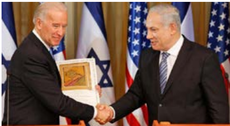
Then Vice President Biden meets with Israeli Prime-Minister Benjamin Netanyahu